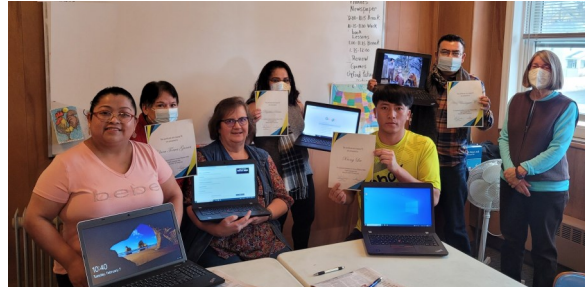
2023 Laptop Giveaway for Students

During the 2022-2023 year we served 476 adults in Chippewa, Dunn and Eau Claire counties. Our students came from 20